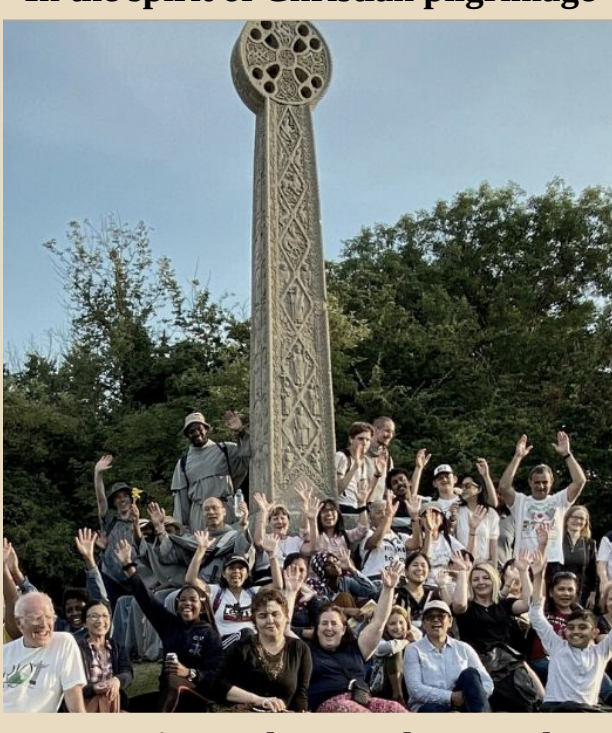
Pray, sing and meet other people