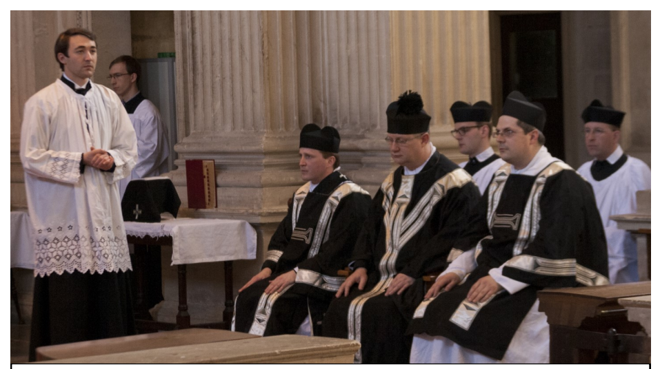
High Mass in Prior Park during the Latin Mass Society's Priest Training Conference. While the choir sings the chants before the Gospel, the priest (in this case, with deacon and subdeacon) must wait for them to finish; he sits on the sedilia. This is one reason Sung and High Masses are longer than Low Mass.

beautiful expression of the Church's 'law of prayer', which always reflects our 'law of belief'. The ceremonies have not just been thought up to look nice: they are ancient and dramatic expressions of the saving truths which are always at the heart of the Catholic liturgy.