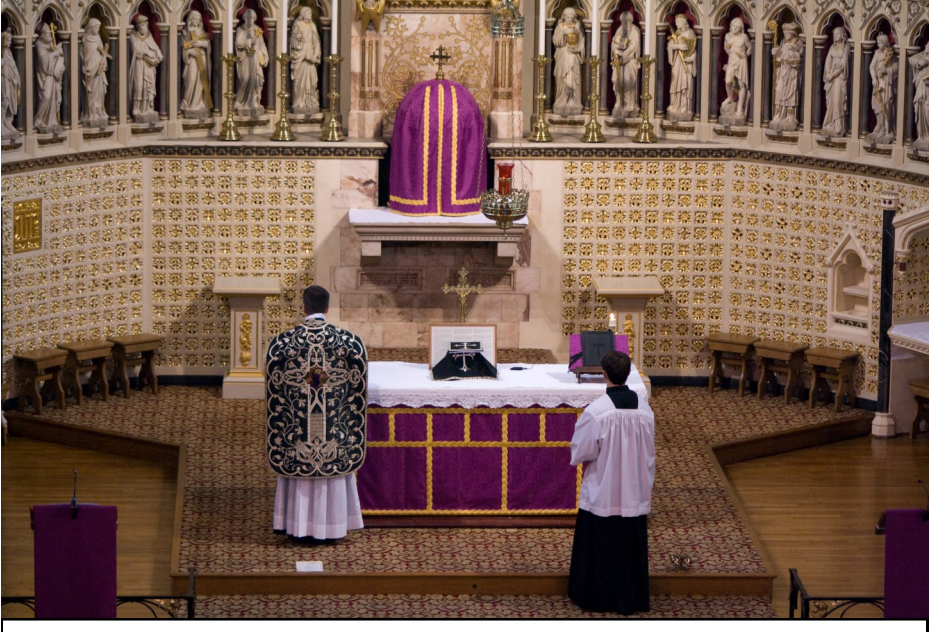
Low Mass with one server, Oxford Oratory (for All Souls' Day).

This has many advantages: priests, singers, funeral directors and con-