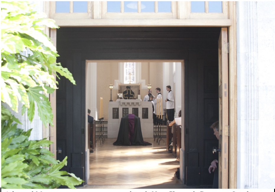
A funeral Missa cantata in a cemetery chapel: New Chiswick Cemetery, London.