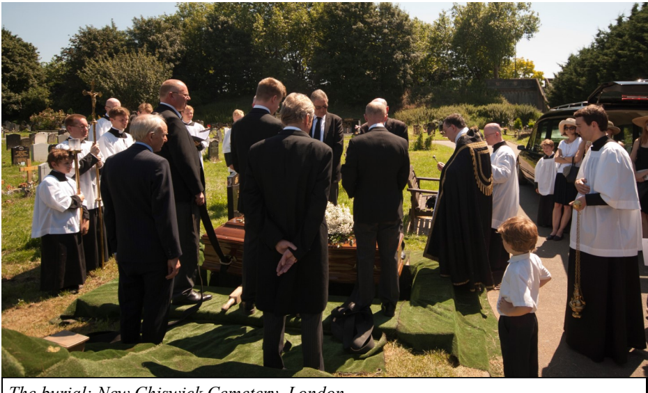
The burial: New Chiswick Cemetery, London.

These Masses are subject to the options discussed above: they may be Low, Sung, or High. In place of a coffin, to be blessed at the end of the Mass, a 'catafalque' can be used: this may be an empty coffin on a stand, or just the coffin stand, covered with a black pall. At its simplest, a piece of black fabric, for example the Chalice veil used in the Mass, can placed on the floor of the sanctuary. The priest blesses this in the same way as the coffin at a funeral Mass. This is optional.