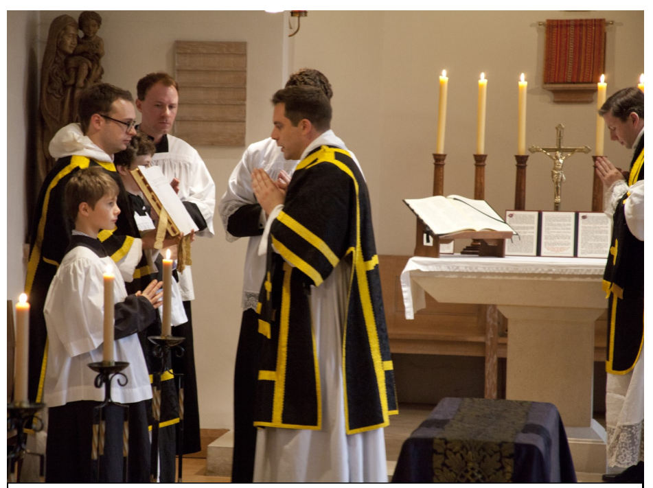
Proclamation of the Gospel by the Deacon, at High Mass: the subdeacon holds the Gospel, and the celebrant watches.

In case of any confusion, the Latin Mass Society will be more than willing to help not only with practical difficulties but with any issues surrounding the interpretation of the Church's law and the attitude of the hierarchy.