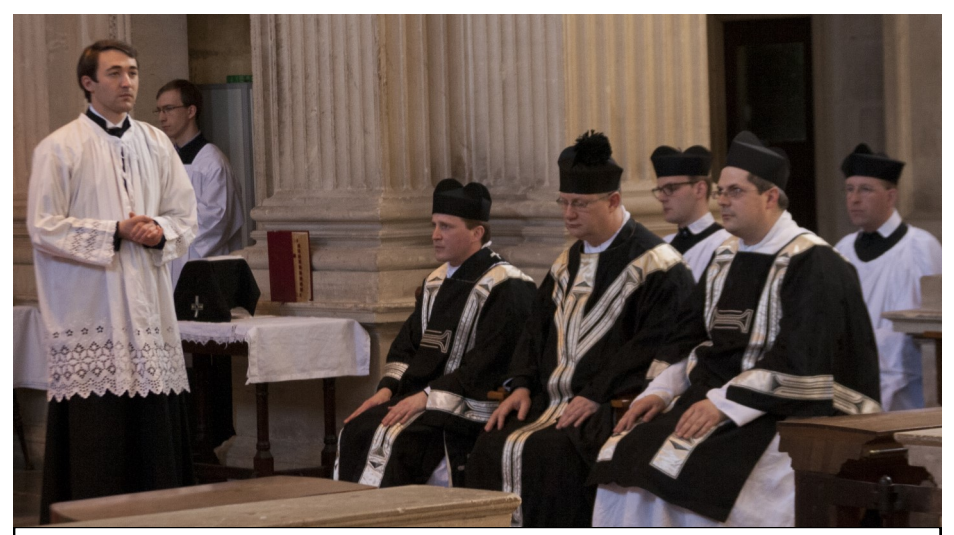
High Mass in Prior Park during the Latin Mass Society's Priest Training Conference. While the choir sings the chants before the Gospel, the priest must wait for them to finish; he sits on the sedilia. This is one reason Sung and High Masses are longer than Low Mass.

beautiful expression of the Church's 'law of prayer', which always reflects our 'law of belief'. The ceremonies have not just been thought up to look nice: they are ancient and dramatic expressions of the saving truths which are always at the heart of the Catholic liturgy.