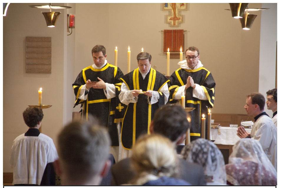
An annual High Mass for deceased members of St Benet's Hall, Oxford.

Wills can be drawn up very simply with a pre-prepared form, but it may be better to discuss the matter with your Solicitor.