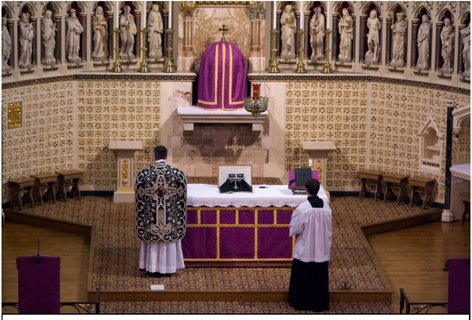
Low Mass with one server, Oxford Oratory (for All Souls' Day).

Below a number of different possibilities are discussed; these reflect the Church's provision for those with more, or fewer, liturgical resources: since there aren't always enough clergy, and there aren't always singers, available for the fullest celebration, and sometimes chapels are not big enough, it is possible to have simpler Masses. What the Extraordinary Form (the Traditional liturgy) does not offer, however, is the kind of multiple options many will be familiar with from the Ordinary Form: choice of readings, choice of hymns at Mass, or choice or prayers. In the Extraordinary Form, the readings and other prayers are fixed (and must be read by the clergy, not lay people); if Mass is to be sung, the singers must sing the texts of the Mass (though there is some, limited, opportunity to sing additional chants or motets); the priest is not at liberty to change, substitute, or remove prayers or ceremonies.