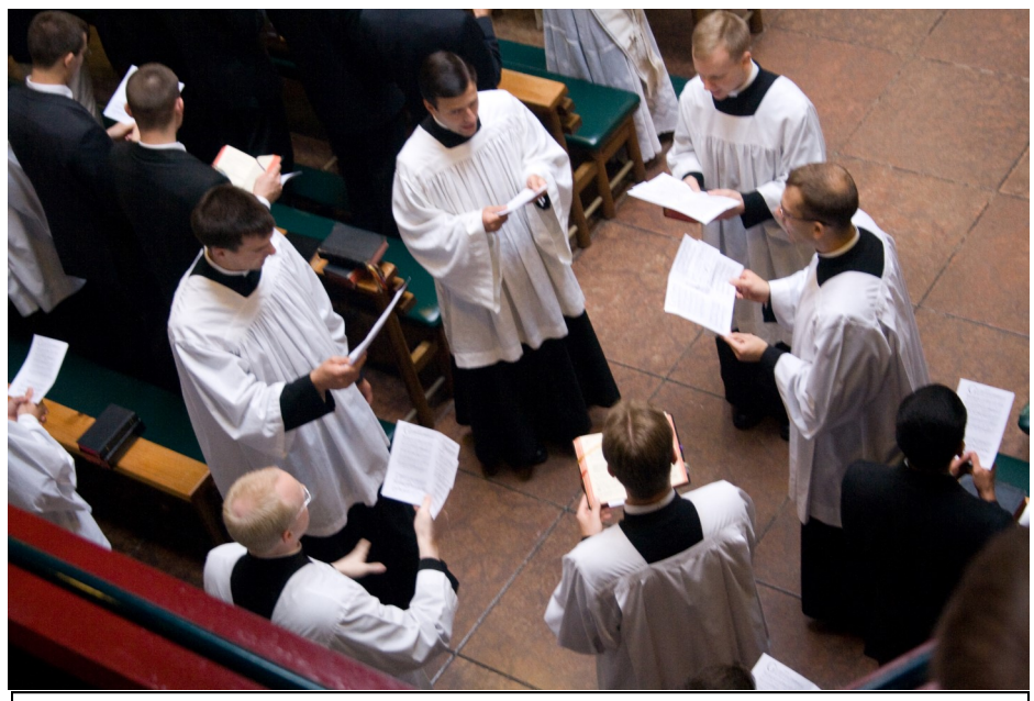
A Chant Schola of FSSP Seminarians at Wigratzbad, Bavaria, during an ordination. An all-male schola, vested like this, can sing from the sanctuary; more often singers use a choir-loft or sing from the back of the church.

A Sung or High Requiem Mass with Gregorian Chant will probably take between 40 and 55 minutes. (Other factors affecting the length of Mass are the length of the homily and the number of people receiving Holy Communion.)