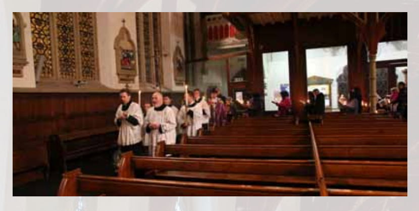
2<sup>nd</sup> February: Procession for Candlemas