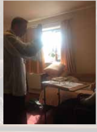
Visit and Holy Communion for the sick