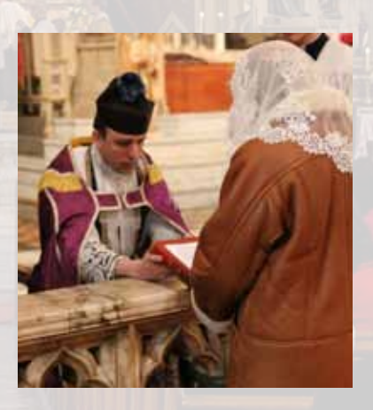
Reception into the Catholic Church during Easter Vigil