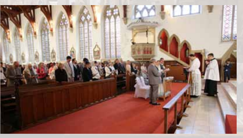
Wedding at St Walburge's on Easter Saturday