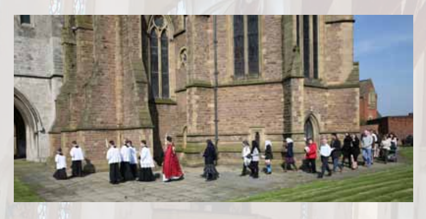
Palm Sunday: Procession around the Church