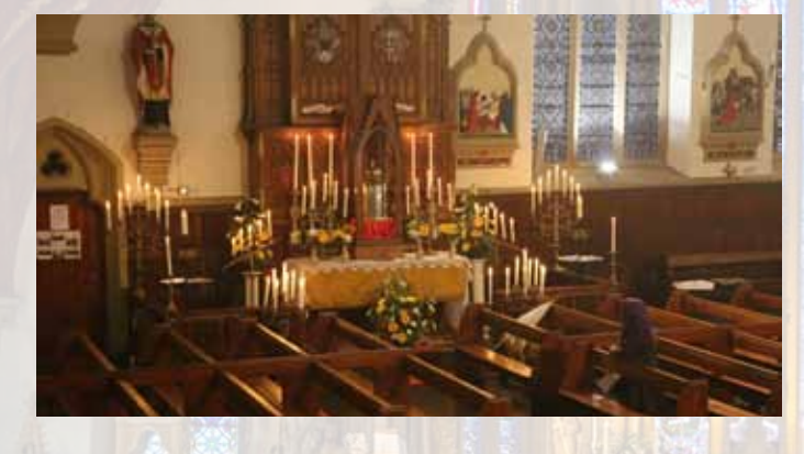
Maundy Thursday: The Altar of Repose