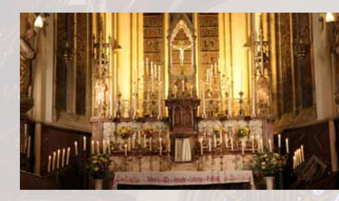
Forty Hours: All-day Adoration