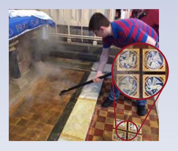
Thanks to a young parishioner who was willing to help, we were able to remove the old red carpets from the side altars. We discovered these beautiful tiles, with the four evangelists