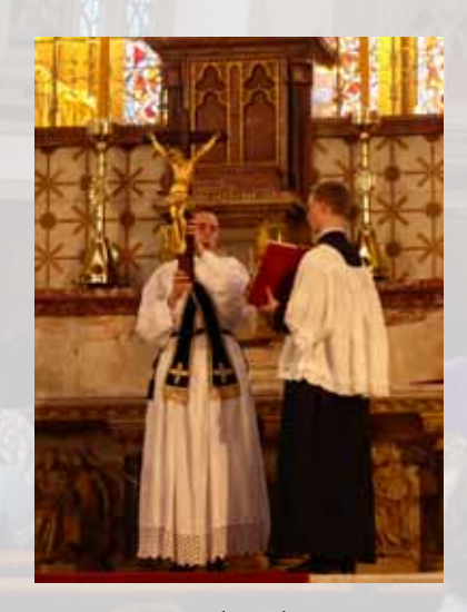
Good Friday: Adoration of the Holy Cross