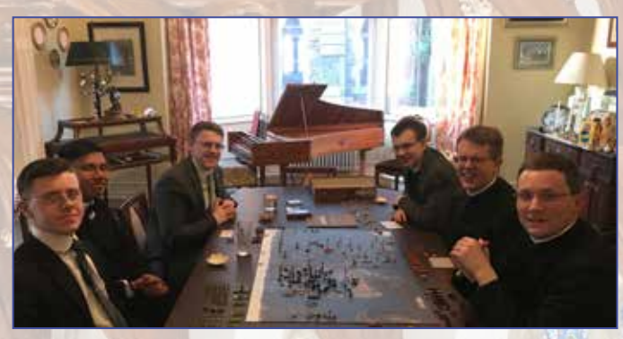
House of Discernment in Recreation

May: English Martyrs' Pilgrimage with the LMS