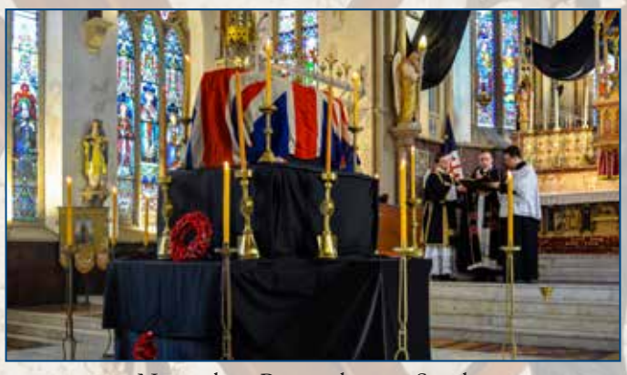
November: Remembrance Sunday