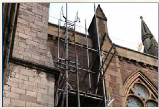
Scaffolding for the roof repairs completed last December.