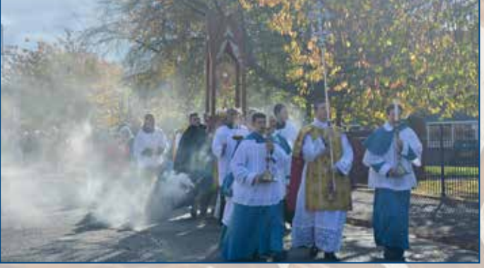
October: Blessed Sacrament Procession for the Feast of Christ the King