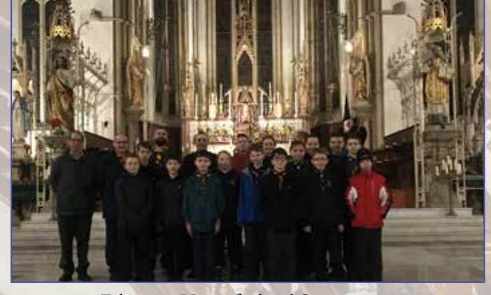
February: Visit of a local Scout group