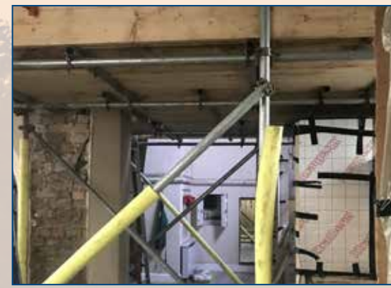
Work in the sacristy continues. With your help, it can be finished by July.