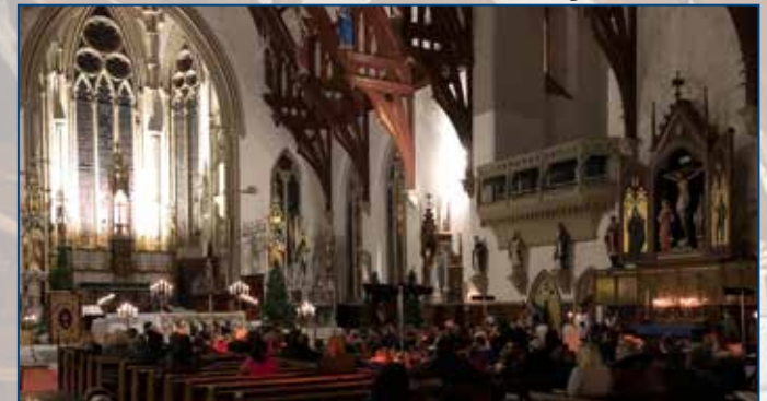
December: Christmas Carol Concert with local primary schools