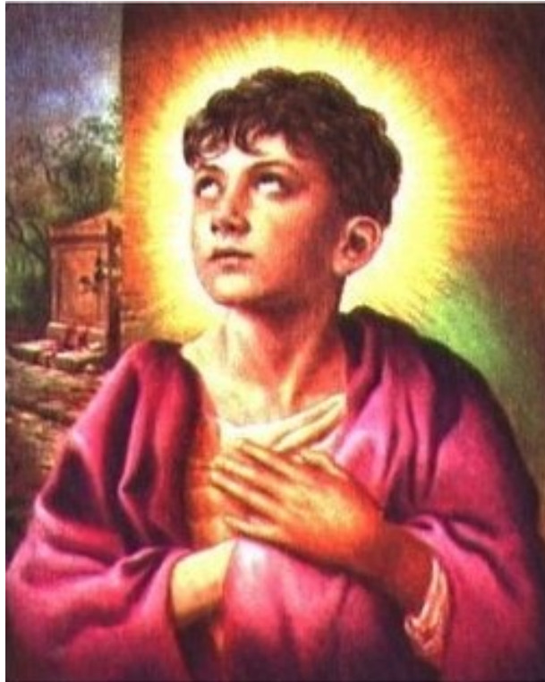
Martyr of the Blessed Sacrament Pray for Us